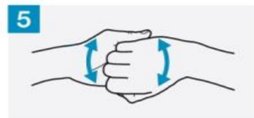
5 Backs of fingers to opposing palms with fingers interlocked;