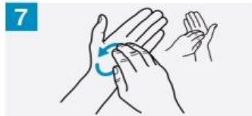
7 Rotational rubbing, backwards and forwards with clasped fingers of right hand in left palm and vice versa;