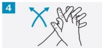
4 Palm to palm with fingers interlaced;