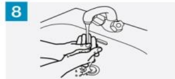
8 Rinse hands with water;