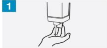
1 Apply enough soap to cover all hand surfaces;