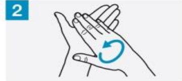
2 Rub hands palm to palm;