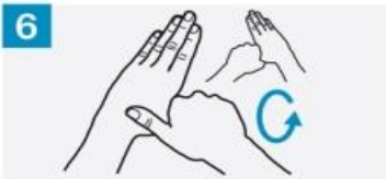
6 Rotational rubbing of left thumb clasped in right palm and vice versa;