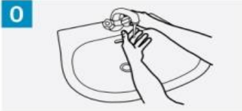
0 Wet hands with water;

Wash hands when visibly soiled. Otherwise, use handrub. Duration of the entire procedure: 40-60 seconds