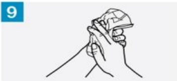
9 Dry hands thoroughly with a single use towel;